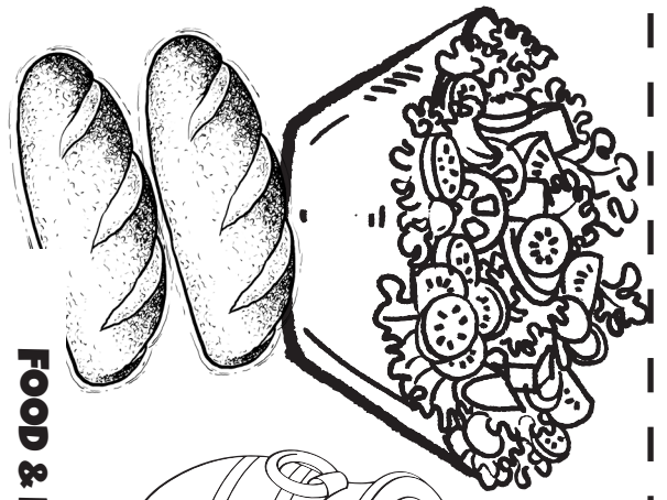
FOOD & DRINK